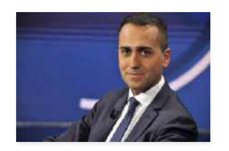
Luigi DI MAIO

EU Special Representative for the Gulf, Italy's Former Foreign Affairs Minister