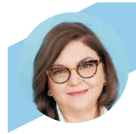
Adina Ioana Vălean European Commission / Commissioner for Transport