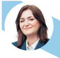
Helena Langšádlová Ministry of Science and Innovation of the Czech Republic