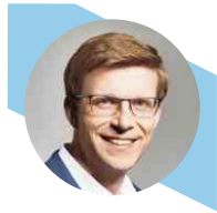
Martin Kupka Ministry of Transport of the Czech Republic