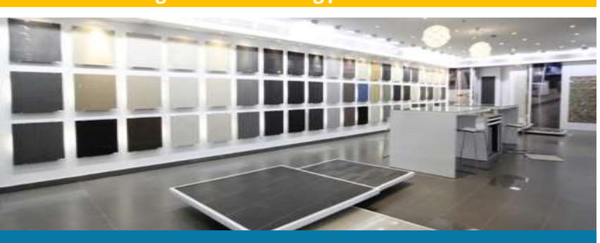
RAK Ceramics is the world's 4th largest ceramic manufacturer