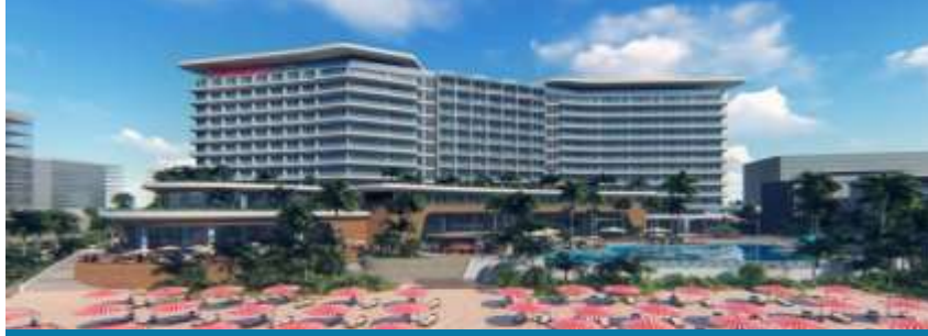
The world's largest Hampton by Hilton is located in Ras Al Khaimah