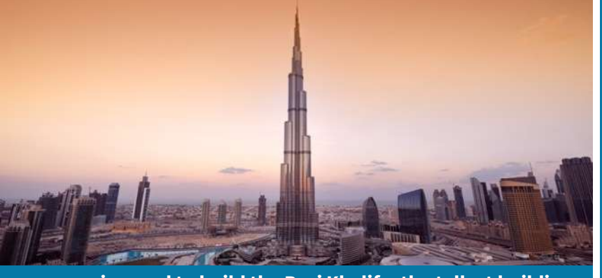
...ceramics used to build the Burj Khalifa, the tallest building in the world, were produced in Ras Al Khaimah.