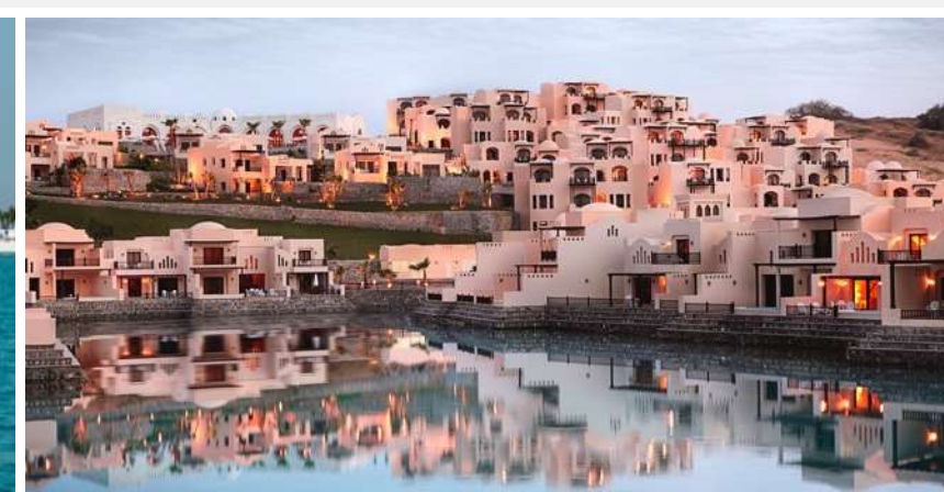
RIXOS BAB AL BAHR