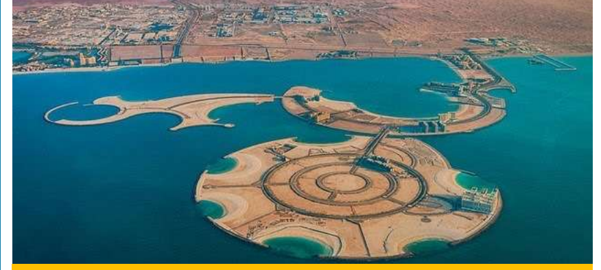
...Ras Al Khaimah set to open first gaming resort in GCC on Al Marjan Island.