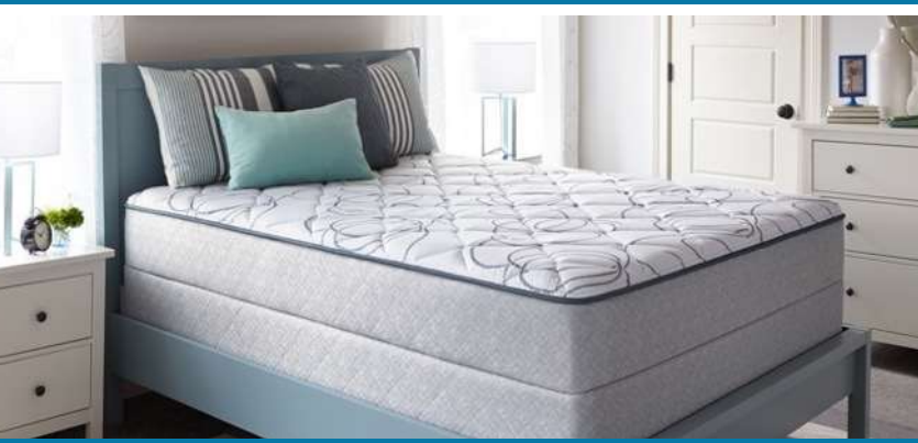
...mattresses used in most of UAE's 5-star hotels are made in Ras Al Khaimah.